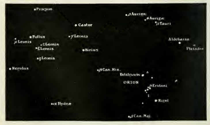
KBY CHART TO THE ABOVE