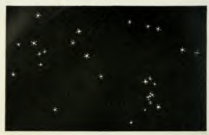
ORO'S CHART OF THE STARS MADE BY HIM ABOUT 250,000 YEARS AGO