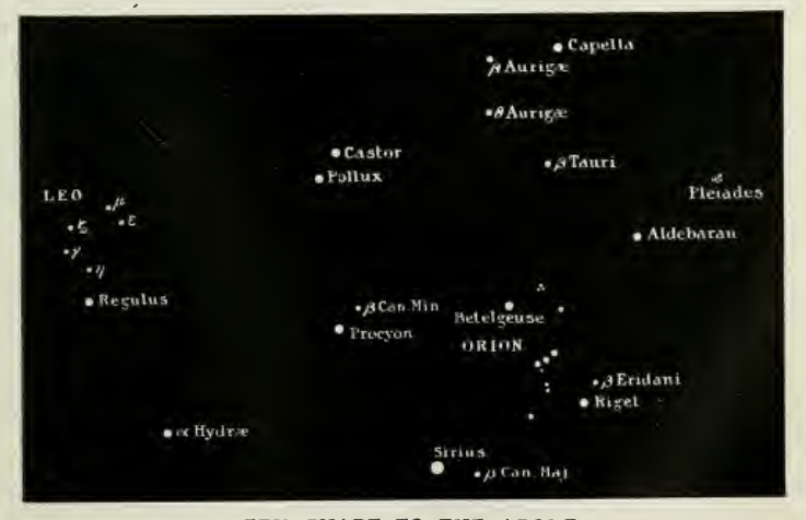
KBY CHART TO THE ABOVE