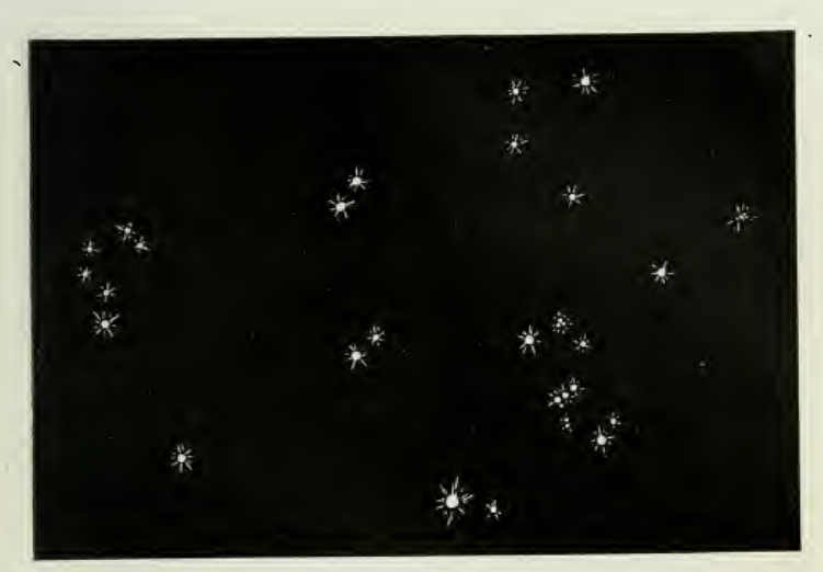
ORO'S CHART OF THE STARS AS HE CALCULATED THAT THEY WOULD APPEAR AT HIS AWAKENING